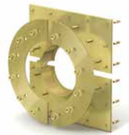
Variant: Curaflex® 7005/T pipe sleeve – split version, for installation with an existing duct.