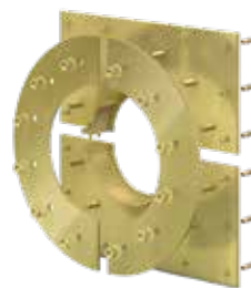
Variant: Curaflex® 7006/T pipe sleeve – split version, for installation with an existing duct.