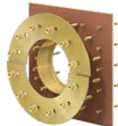
Variant: Curaflex® 7006 pipe sleeve, sanded