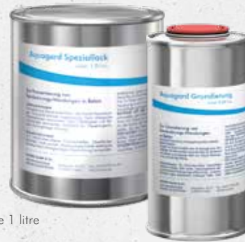
Delivery size 1 litre