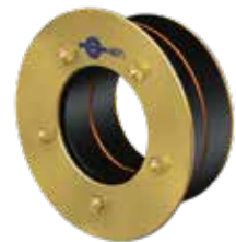
Variant: Curaflex® D – properties as described above, but with mounting from the pressure-facing side ('water side').