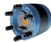
Curaflex Nova® Multi

The minimum bending radii for the media pipes/cables to be installed must be observed.