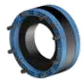
Curaflex Nova® Uno