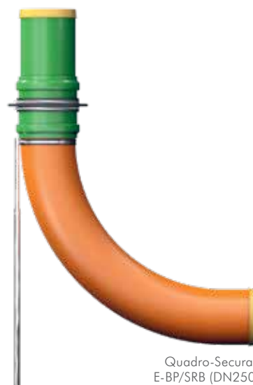
Quadro-Sicura® E-BP/SRB (DN250)