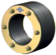
Curaflex Nova® C40/SRB

Additional information about our Curaflex® sealing systems can be found in the applicable product documentation.