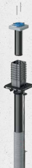
Quadro-Sicura® Nova R1